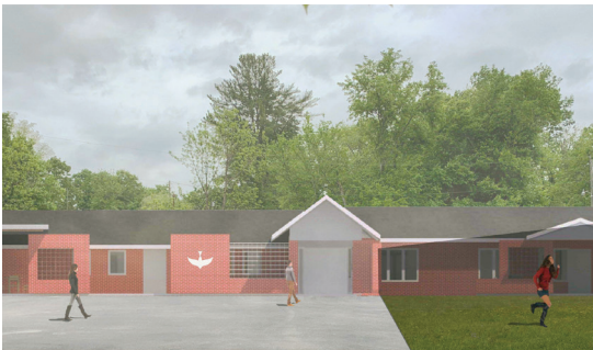
Rendering of Essary Cottage provided by George Armour Ewart Architect.