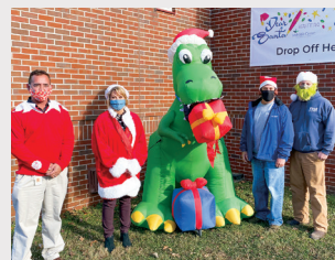
At the 2019 event

The Dear Santa program continues to grow, more than doubling in the last 10 years! In 2020, the program provided