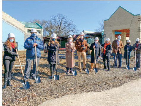
The community came together for a COVID-friendly groundbreaking.

Dogwood Springs at Mineral Springs Ave. will offer 50 one-bedroom units of much-needed low-income housing to senior citizens in the Knoxville area. This unique housing program will offer independent living to seniors experiencing issues with the aging process. The McNabb Center broke ground on this project in 2020. This nearly $8 million project is possible because of the financial support of the City of Knoxville, Knox County, Federal Home Loan Bank-Cincinnati, the Tennessee Housing Development Agency, the Tennessee Department of Mental Health & Substance Abuse Services and numerous private donors.