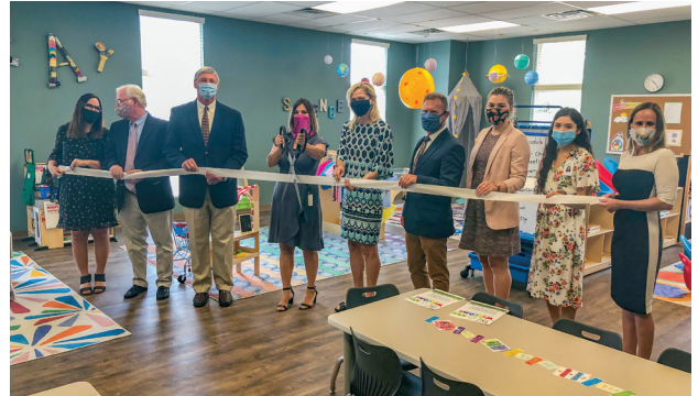
Ribbon cutting at the new therapeutic preschool in Chattanooga.

In 2020, the McNabb Center opened its second Therapeutic Preschool program, which expands this service to the Greater Chattanooga Area. The McNabb Center offers the only two Therapeutic Preschools in the state of Tennessee. The programs provide intensive early intervention services to children ages 4-6 who have been abused or neglected, or who have experienced trauma of any kind. Children enrolled in the preschool have special emotional needs that many childcare and school facilities are not able to accommodate. The goal of this campaign is to raise $600,000 to fund the new Chattanooga Therapeutic Preschool for three years.