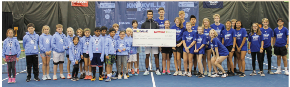
A large number of youth volunteer at the Knoxville Challenger tennis tournament

Volunteers are a core part of the Foundation. We strongly rely on volunteers to make each fundraising event possible. Last year, 1,172 volunteers gave 32,894 hours of service to Foundation events and Center programs. Knoxville Challenger is the largest fundraising event hosted by the Foundation and relies on the most volunteers. The 2019 event was made possible by the efforts of nearly 400 volunteers giving more than 3,000 hours. Volunteers assisted with the Challenger committee, ball kids, score keepers and numerous other event positions, which helped create a wonderful experience for everyone attending the tournament.