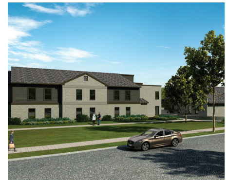
Mineral Springs Manor architectural rendering

Mineral Springs Manor will offer 50 one-bedroom units of much-needed low-income housing to senior citizens in the Knoxville area. This unique housing program will offer independent living to seniors experiencing issues with the aging process. It can offer supportive services that help seniors retain their independence and maintain their safety. This nearly $6 million project is possible because of the financial support of the City of Knoxville, Knox County, Federal Home Loan Bank-Cincinnati, the Tennessee Housing Development Agency and numerous private donors.